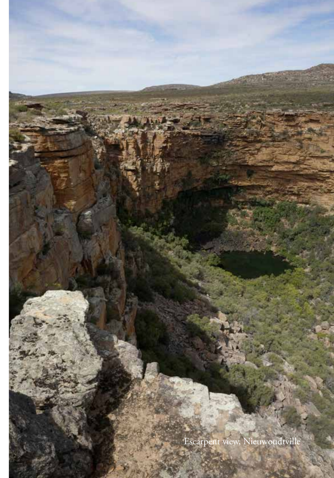
Escarpment view, Nieuwoudtville

Fortunately, the power cuts fell at the right time and I managed my zoom talk to a group in Ireland. The wonders of modern tech!